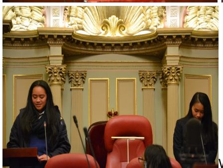
Westall Sec College