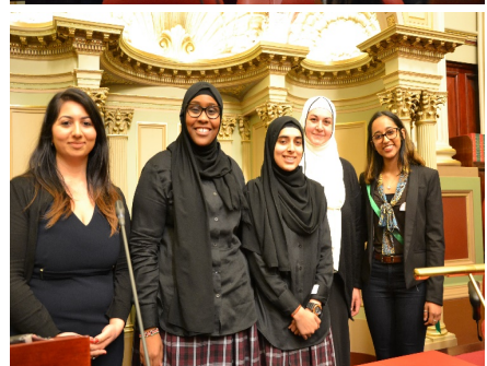
Al Siraat speakers with